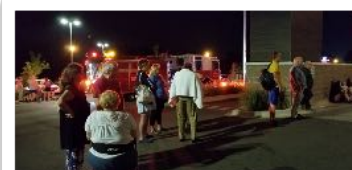
Kiwanians got an early morning (around 1:30am) surprise! A fire alarm and constant message over the speaker telling occupants of the hotel to exit the building. Many left the building and waited an hour or two for the ok to go back in. Later that morning, the manager of the hotel explained that a sensor in an elevator had malfunctioned.