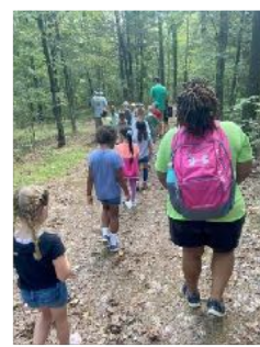
A nature hike on one of the many trails at the camp.