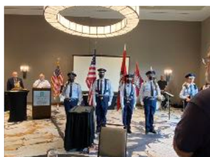
Westside High School, Jonesboro, AR, Junior ROTC present colors at the luncheon.