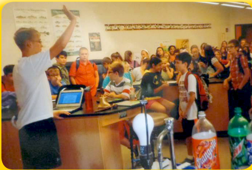
Junior High students overcrowd the classroom for the first meeting of the Fountain Lake Junior High Builders Club.

Almost 200 students from Fountain Lake Junior High showed up for the organizational meeting of the Kiwanis Builders Club, sponsored by the Kiwanis Club of Greater Hot Springs Village (Arkansas). With a mission to “Build Leaders,” the club includes service projects, social activities and electing its own leaders. The major problem now is limiting the size. As Kiwanis sponsor Gwen Bonds said, “There’s no room large enough to hold them, but we don’t want to discourage anyone.” She will be looking for more volunteers to help with supervision.