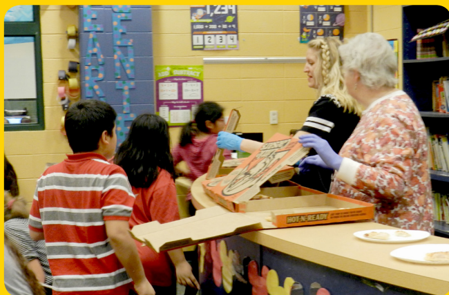
Left: Volunteers serve pizza to B.U.G. program participants.