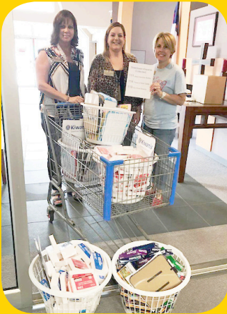
Above: Members of the Downtown Springfield Kiwanis Club with donations for the RSVP Reading Buddies program.

Kiwanians in Springfield (MO) showed their community spirit by helping with the 25th annual United Way Day of Caring, which provided service to non-profit organizations throughout the city. The Kiwanis Club of Downtown Springfield collected note cards, hand sanitizer and dry erase boards for the RSVP Reading Buddies program as part of the Day of Caring. Members of the Ozark Empire club and Springfield-South clubs help improve the landscaping at a local Boys and Girls Club.