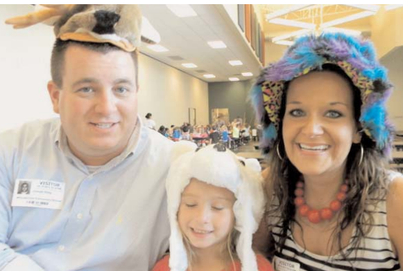
When the “Terrific Kids” of the Bentonville (Ark.) Kiwanis Club are recognized, the parents come to help celebrate the accomplishments of their children.

(continued from page nine) ed in the Polar Plunge to support Southeast Special Olympics.