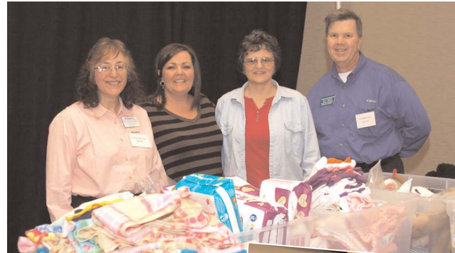
Mid-Winter project this year was collecting items for Newborns in Need .