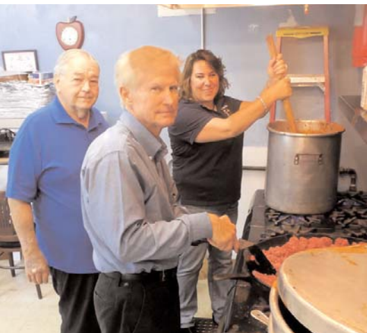
North Kansas City Kiwanians take pride in making their special chili each year.