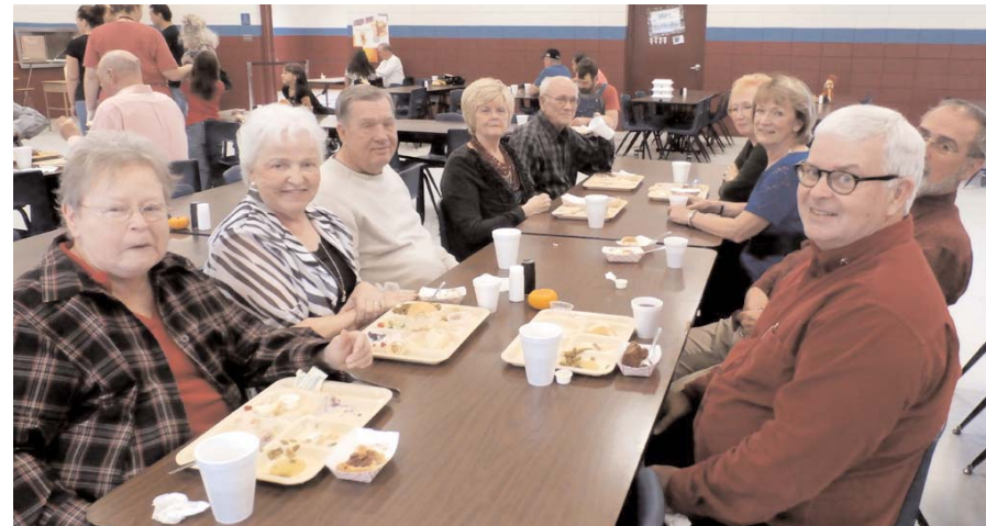
The Thanksgiving Day Dinner sponsored by the Huntsville (Ark.) Kiwanis Club was a big success and included some visitors from the Springdale Kiwanis Club.

(continued from page eleven) City (Mo.) donated $2,500 to the Samaritan Center for the agency's Christmas efforts. The Jefferson City K-Kids Club held a shoe drive at their school for the Shoeman Water Project. Old shoes are recycled or resold in countries that do not have access to clean water. Money from the shoes is used to dig wells and add purification systems in places like Kenya, South