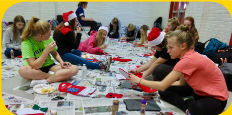
Students from Union High School and Union Middle School busy decorating Christmas stockings.

Kids in the early childhood education program of the Union School District were happy to receive Christmas Stockings from Union Kiwanis members. The felt stockings were made by Kiwanis members, and decorated by Union High School and Middle School students - including Key Club and Builders Club members. The stockings were filled with a book, crayons, a hat and gloves and toys - including a wooden puzzle designed and decorated by Kiwanis members with the help of Key Club members and K-Kids.