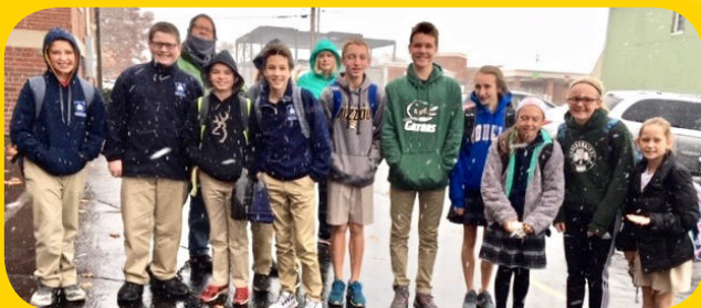
Above: IC Builders Club members walked several blocks after school in snowy weather to Artzy Wallz (an arts and craft shop in Union) where they decorated stockings along with Key Club members and Union Kiwanis members.

The new Builders Club at Immaculate Conception (IC) School in Union (MO) was formed in October 2018 with 30 charter members. They are sponsored by the Union Kiwanis Club. Everyone who sees the Builders Club in action is impressed by their leadership, energy and excitement.