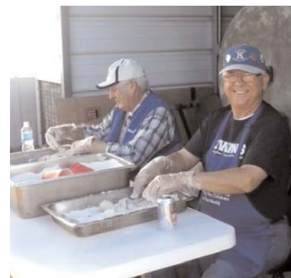
The Kiwanis Club of Sikeston (Mo.) held its annual Fish Fry on October 21 with great success. With their Key Club's help, almost $5,000 was raised.

The Fort Smith (Ark.) Commissary Kiwanis Club was recently recognized for its role in developing Cavanaugh Park, dedicated earlier this year. Once a dilapidated trailer park when the school district bought the property across from Cavanaugh Elementary School several years ago, it is now a very useful park with a substantial pavilion, constructed mostly by Commissary Kiwanis. The city and many other groups and individuals help make Cavanaugh Park a very useful part of the community.