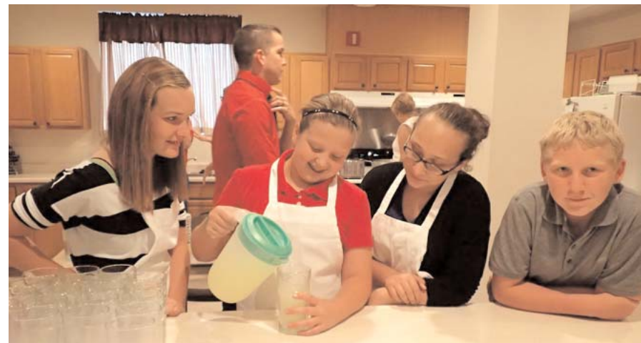
Union Middle School Builders Club members worked alongside 13 Union Kiwanis members to serve more than 85 adults and children at a Community Dinner.

The Kiwanis Club of St. Charles (Mo.) recently toured the Ronald McDonald House on the campus of Mercy Hospital in St. Louis. Along with a guided tour of the facility, members of the St. Charles Kiwanis Club brought donations as part of a service project to the house. These donations will go toward the benefit of the families who are utilizing the services of the Ronald McDonald House and the Ronald