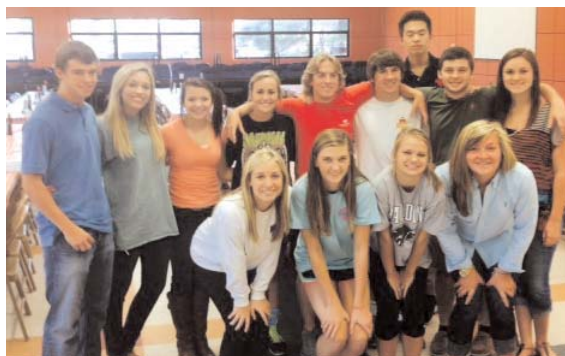
The El Dorado (Ark.) High School Key Club members, pictured here, were a big help to the El Dorado Kiwanis Club for its annual Pancake Day fund raiser in October when over 2,000 pancake meals were served.