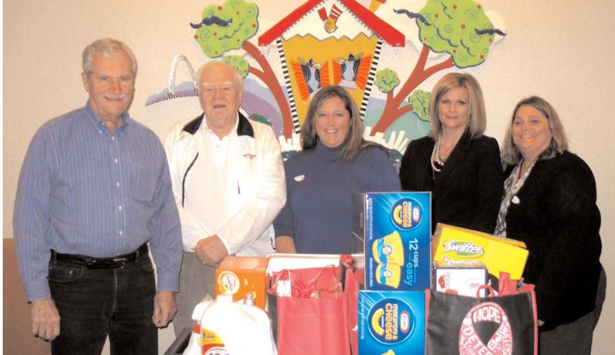
The Kiwanis Club of St. Charles (Mo.) recently toured the Ronald McDonald House at Mercy Hospital in St. Louis and brought donations to be used in the “home away from home” for families of seriously ill children.

(continued from page seven) Kiwanians and over a dozen El Dorado High School Key Club members participated in the event during which 2,000 pancake meals were served. The event raised over $16,000 dollars. On November 6, the club participated in its annual Operation Christmas Child shoebox packing event. Six club members joined other local service club members and packed more than 1,600