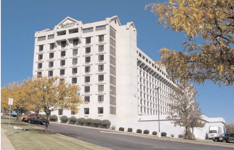
The Radisson Hotel in Branson will be site of the Mid-Winter Conference in 2015.