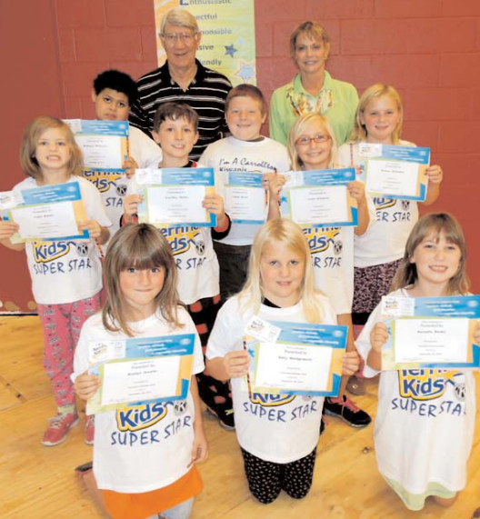
These Terrific Kids were recognized by the sponsoring Carrollton (Mo.) Kiwanis Club.