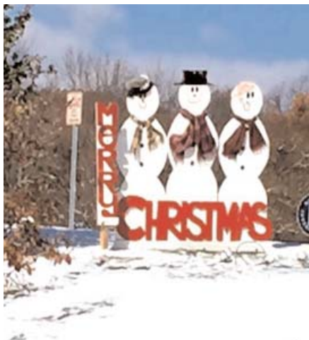
The annual Christmas display was put up this year by Cape Girardeau Kiwanis.

The Kiwanis Club of St. Charles (Mo.) recently toured the Ronald McDonald House on the campus of Mercy Hospital in St. Louis. Along with a guided tour of the facility, members of the St. Charles Kiwanis Club brought donations as part of a service project to the house. These donations will go toward the benefit of the families who are utilizing the services of the Ronald McDonald House and the Ronald