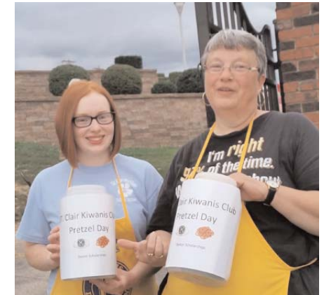
This Key Clubber and St. Clair (Mo.) Kiwanian were collecting for the Kiwanis Pretzel Day (formerly Peanut Day).

The Columbia Boonslick (Mo.) Kiwanis Club presented three special