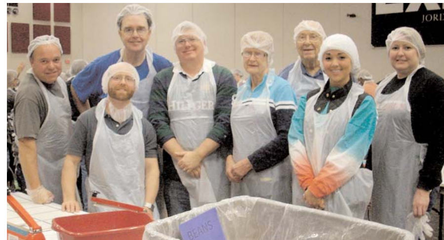
The “Friends Against Hunger” Meals-A-Million Pack-a-thon was held in November and Springfield (Mo.) South Kiwanis Club members helped with morning and afternoon shifts. As a bonus, they each got to get their picture taken wearing a silly hair net.