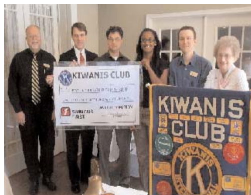
The Kiwanis Club of Pine Bluff (Ark.) hosted a chicken dinner fund raiser in September for the Boys and Girls Club of Jefferson County, raising $1,300.

(continued from page nine) third grade students at Hallsville Intermediate School.