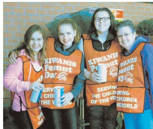
The Crestwood Sunset Hills Kiwanis had a great Peanut Day in October and raised over $1,000 for their Builders Club.

Cape Public Schools. You can tell by my age that it was many years ago.