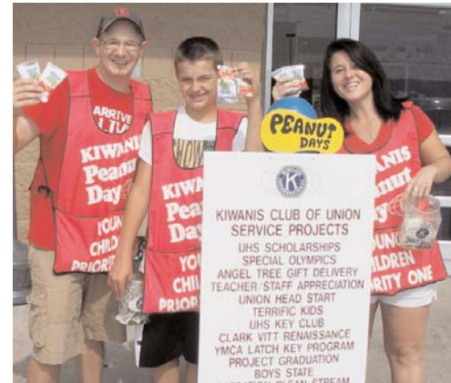
At the collection point for the Union (Mo.) Kiwanis Peanut Day, notice the nice poster listing club service projects.

Richmond (Mo.) Kiwanis’ “Trick or Treat Street,” in collaboration with the Richmond police, was a huge success. There were many area businesses and individuals who donated time and money. There were an estimated 1,100 kids served. Also, the club presented